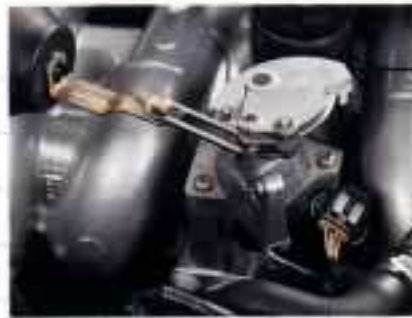
A new fuel injection throttle body design now incorporates the idle speed control motor.