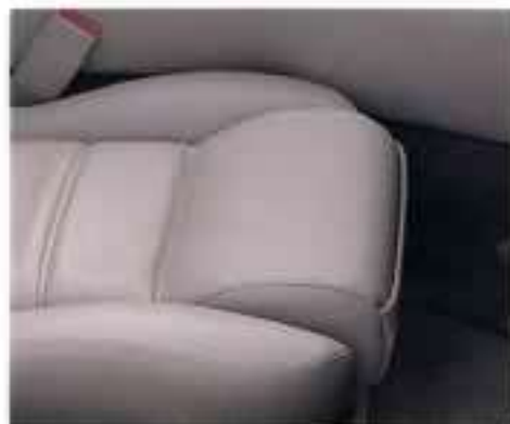
A handy storage pouch with elastic closure is found on the forward edge of each front seat.

All 1995 S-types will be pre-wired for a cellular phone. Additionally, the tread-plate which covers the door sill is now formed in aluminum, therefore less likely to show scratches than the previous stainless steel insert. In the trunk, a one-piece contoured carpet is fitted to provide a luxurious, well-finished appearance.