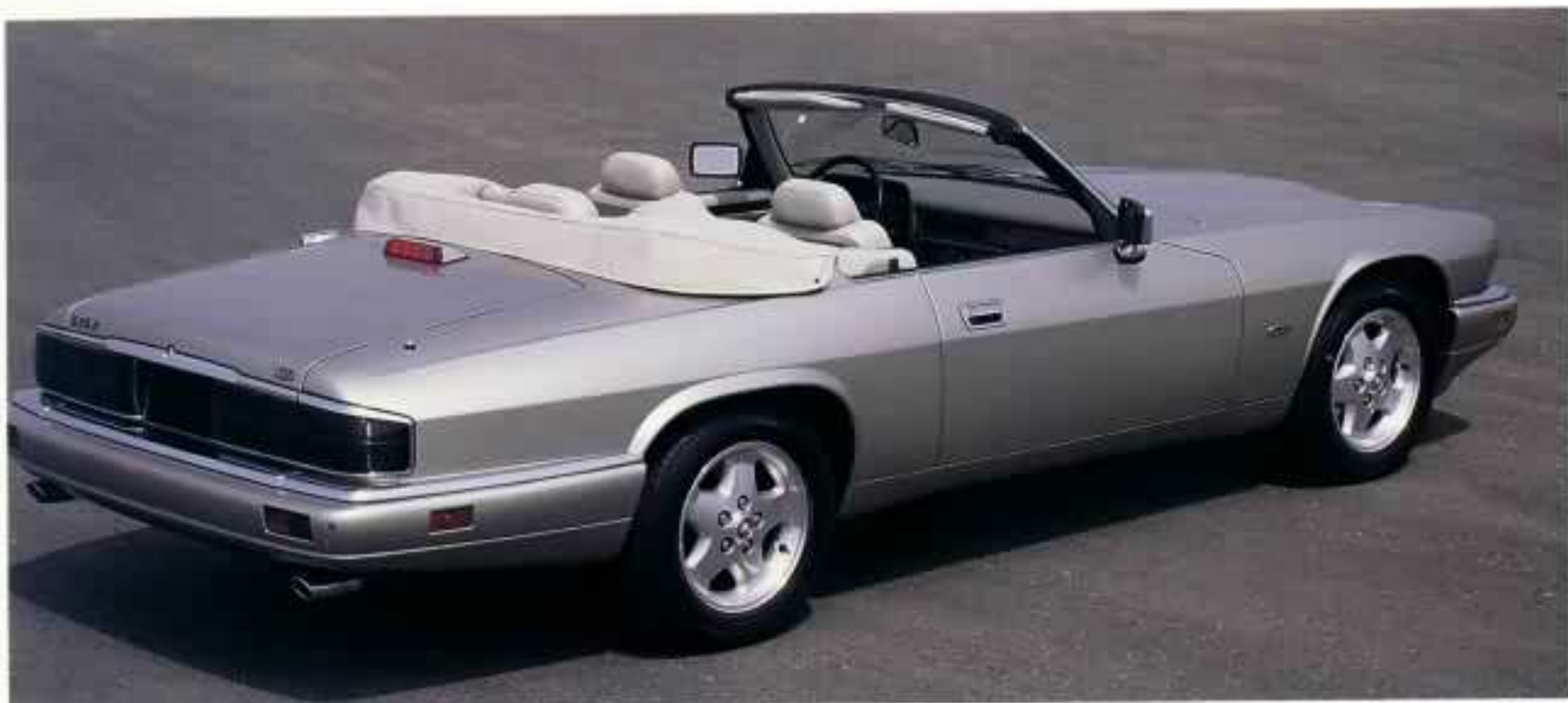
1995 XJS 4.0L Convertible