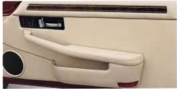
Door casings of 6.0L S-types are finished in Autolux leather (including speaker grille bezels) with contrast piping in place of previous chrome strips.