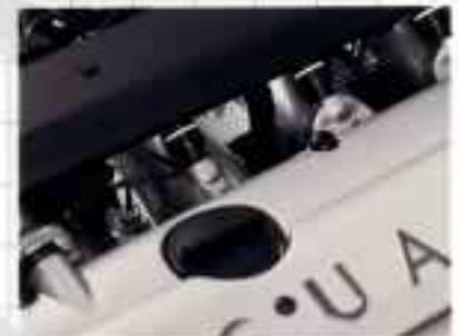
Fuel injectors have been revised to match their flow rates to the demands of the new engine management system.

terminals for greater reliability. The fuel rail is covered to improve underhood appearance.