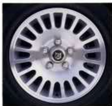
The 20-spoke wheel with diamond-turned finish is standard equipment on V12 S-types.