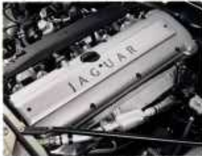
The camshaft cover is a magnesium casting which weighs less and reduces valve train noise. The exhaust manifold (below bright cover) has been modified for better sealing and no longer carries the EGR valve.