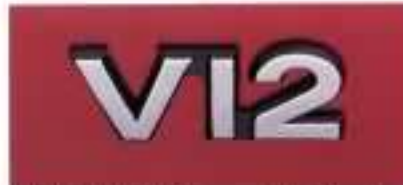
The 6.0L XJS is readily identified by the silver-tone V12 emblem on the lower front fender.