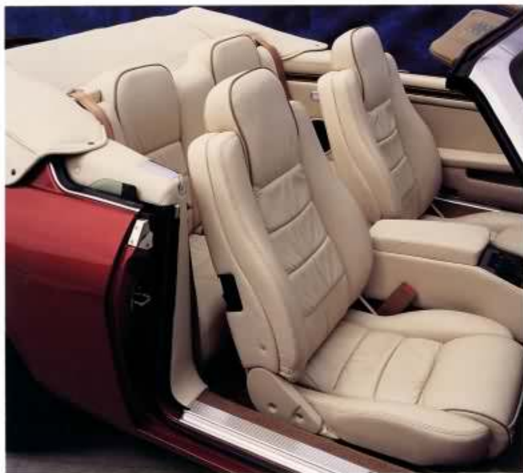
Fine Autolux leather graces the interior of the 6.0L S-type.