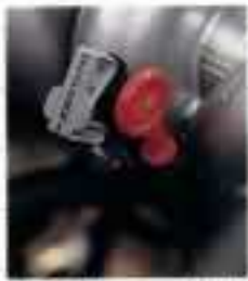
Positive seal of the automatic transmission dipstick tube is assured by a locking, flip-top design.