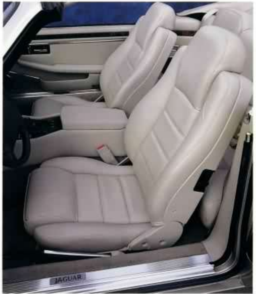
Seats are upholstered in a new four-panel pattern.