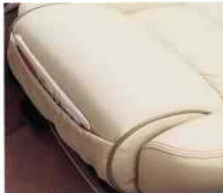
A convenient storage pouch is provided on the forward edge of each front seat.