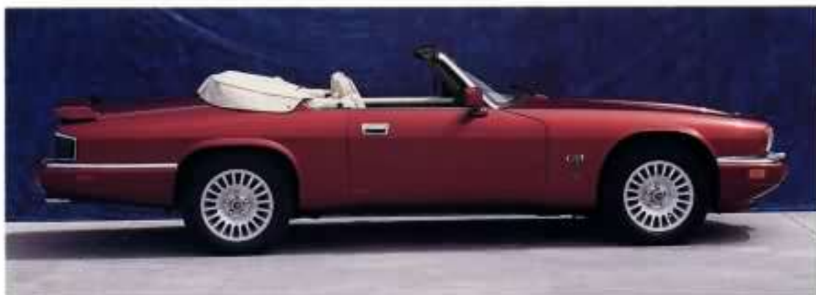
1995 XJS 6.0L Convertible

The range of interior color choices has been expanded, and in response to customer requests, revised to include lighter shades that contribute to an open, airy