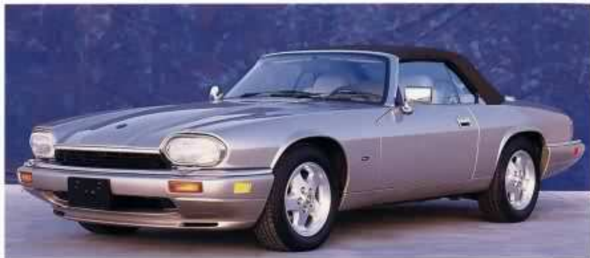
1995 XJS 4.0L Convertible

The major mechanical changes in the XJS 4.0L are accompanied by modest visual changes. Still, the upgrades are noteworthy: Five-spoke, 16" diameter wheels with diamond-turned finish are now standard equipment and the OE tire is a Z-rated (that is, rated for speeds above 149 mph) Pirelli 4000E in the 225/60 size. The center cap of the wheel carries a silver growler on red background, and the leaper badge on the front fender sports a matching red background.