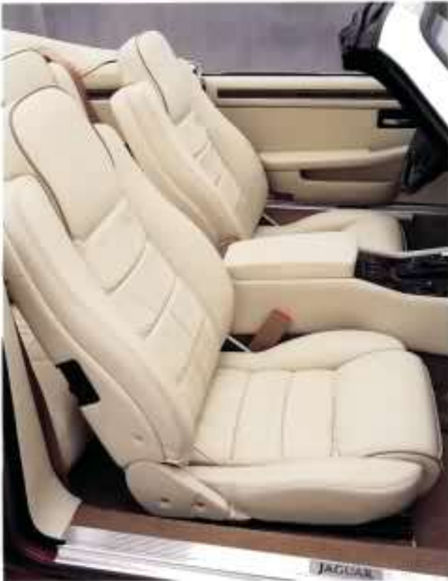
Autolux leather seats in the 6.0L models are upholstered in a four-panel design with rucked center panels, contrast piping and stitching.