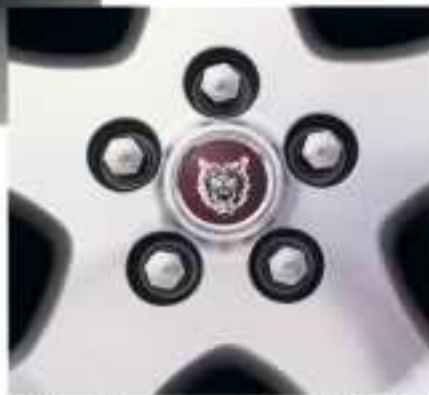
Wheel center caps coordinate with fender badges, displaying a silver growler on red background.

vertibles, the lamps located in the rear quarter casings now illuminate when the door is opened or when activated by the fascia switch.