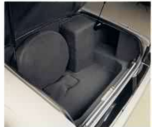
The trunk is luxuriously finished with a one-piece, contoured carpet.