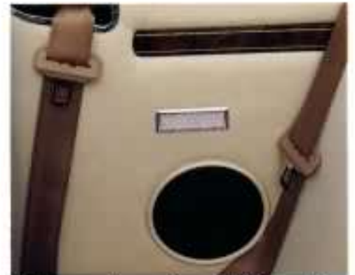
Rear quarter casings in V12 models are Autolux covered, feature contrast stitching, leather-trimmed speaker grille bezels.