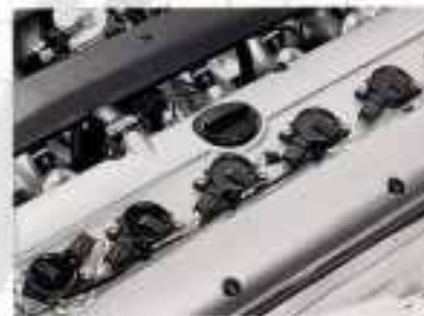
Individual ignition coils are mounted directly at the spark plugs. The coils are located under the center section of the camshaft cover which carries the Jaguar logotype.