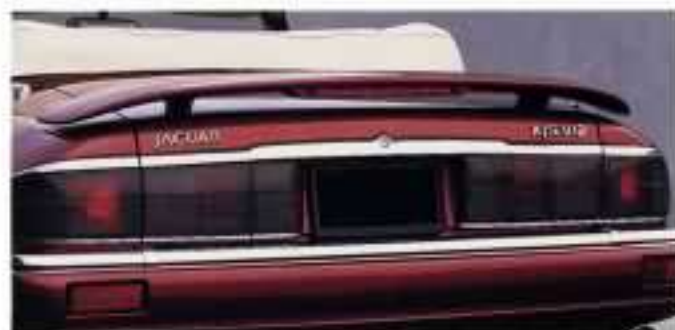
The high mount stop lamp is incorporated into the rear spoiler of 6.0L models.