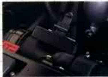
The mass airflow sensor uses gold-plated electrical terminals for optimum reliability.