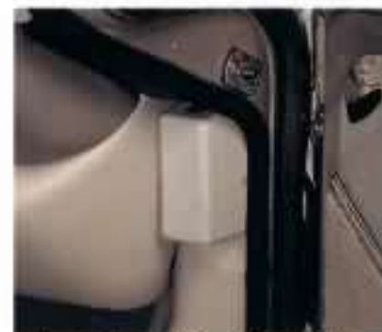
A redesigned inertia switch provides emergency fuel pump shut-off.