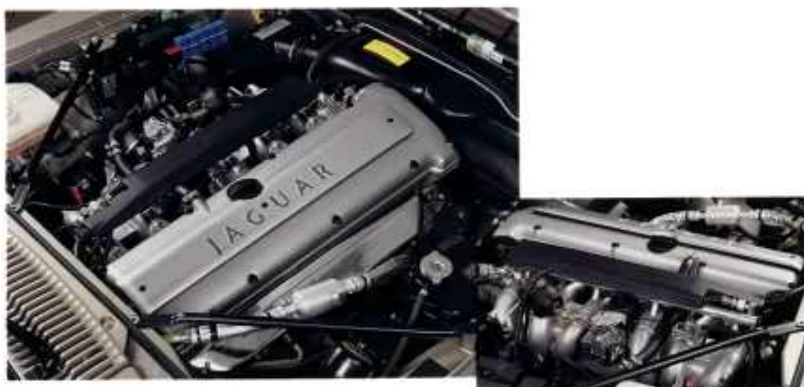
A new intake manifold offers improved sealing. The fuel injector rail (under the black housing) is now covered to give the engine compartment a cleaner look.

The cornerstone of the engine improvements is a new electronic engine management system. From regulating the fuel injection system to coordinating communications with the automatic transmission, this system brings together a wide variety of functions and places them under the control of a central microprocessor unit. To some extent, this change has been made to comply with legislation that stipulates the use of