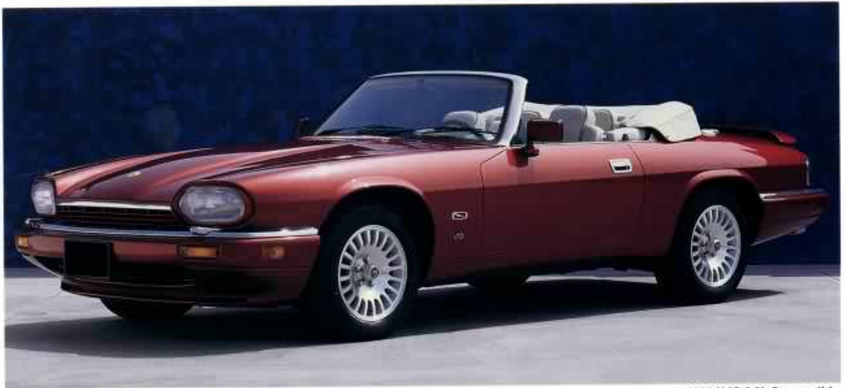
1995 XJS 6.0L Convertible