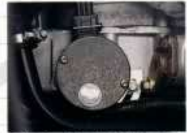
The ignition distributor has been replaced by a camshaft position sensor which provides information to the electronic engine management system.