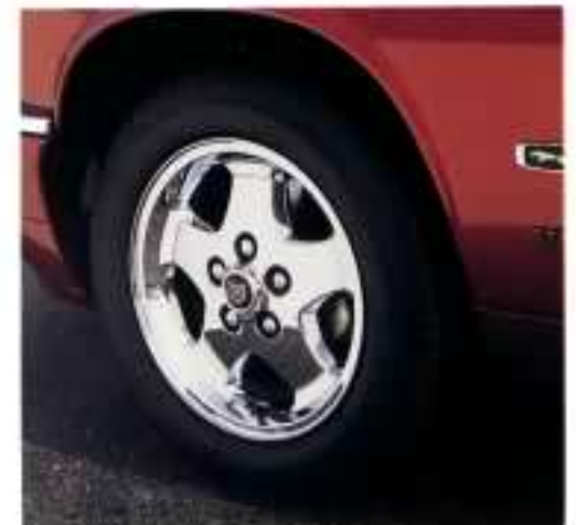
Chrome-finish five-spoke alloy wheels DI are an available option.

All 1995 S-types will be pre-wired for a cellular phone. Additionally, the stainless steel treadplate insert which covered the door sill is now replaced by one formed in aluminum which is less prone to scratching. In the trunk, a one-piece contoured carpet is fitted to provide a luxurious, well-finished appearance. The space saver spare tire is now mounted on a steel wheel.