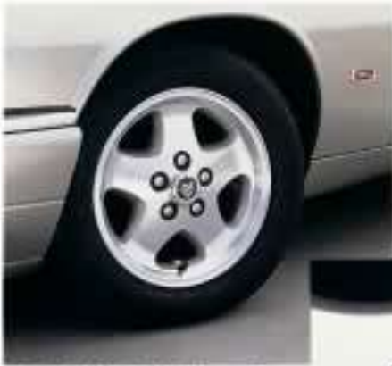
The XJS 4.0L is fitted with 16-inch wheels—a five-spoke design with diamond-turned finish.