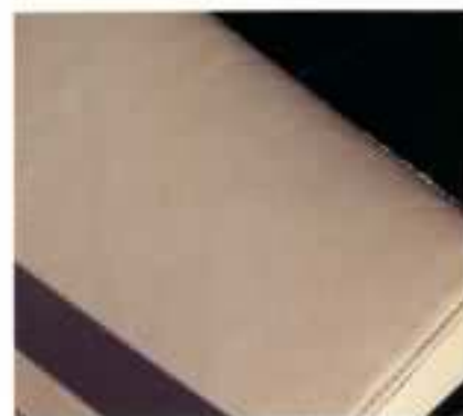
Shallower grain leather offers a more supple feel.