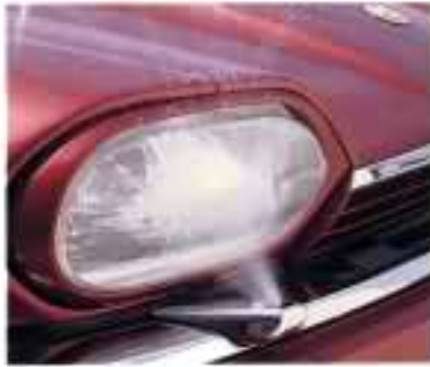
Headlight power wash is standard equipment on the V12 XJS.