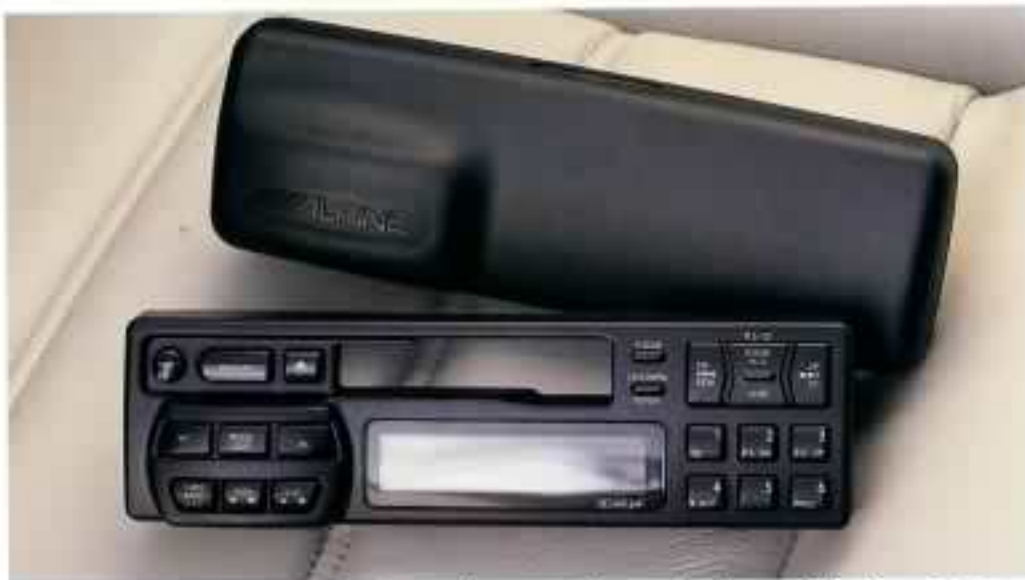
A detachable front panel for the audio system is an effective anti-theft provision.

nighttime operation without the need to divert attention from the road.