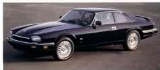
1995 XJS 6.0L Coupe

feel (see chart inside back cover). The natural grain Autolux leather will be available in seven colors as standard equipment on V12 cars.