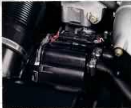
While the air injection pump remains in the same location, it is now electrically powered rather than belt driven.