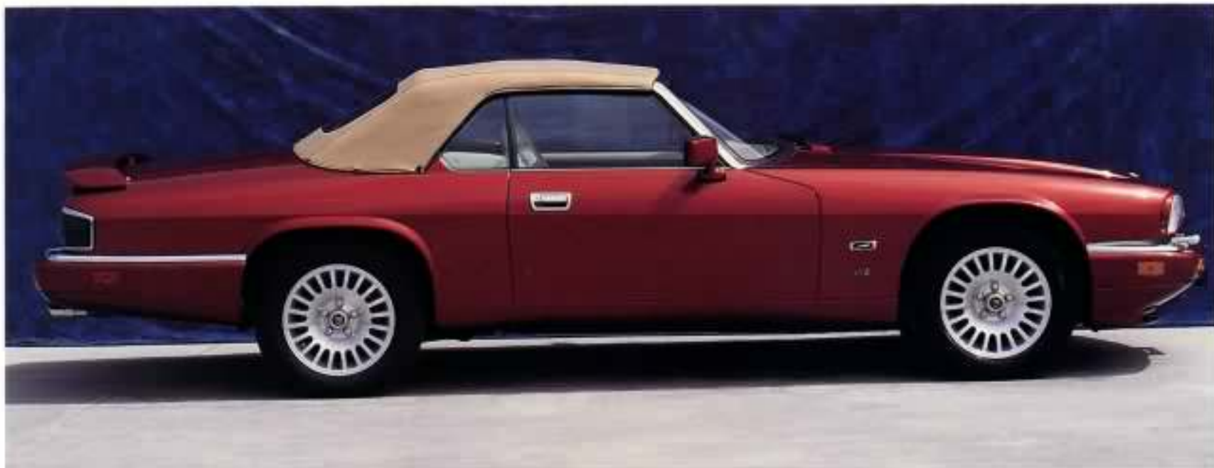
Beige is one of five top colors available on 1995 XJS Convertibles.