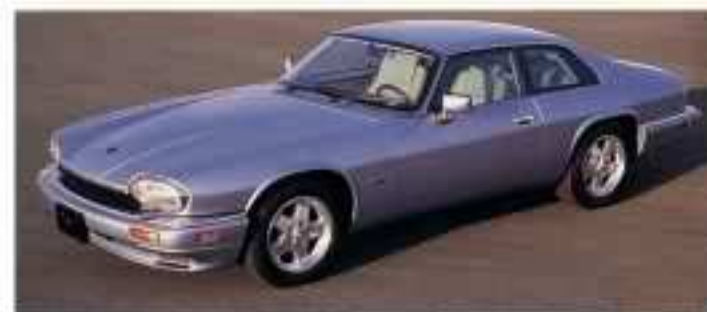
1995 XJS 4.0L Coupe