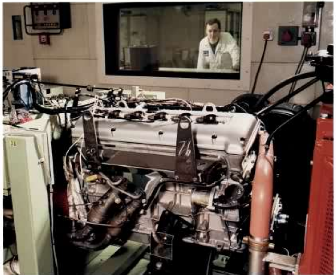
Testing on the engine dynamometer verified the durability of the new 237hp AJ16 engine.

The improvements in product quality are the result of many factors, from the redesign of vehicle components to the updating of manufacturing facilities