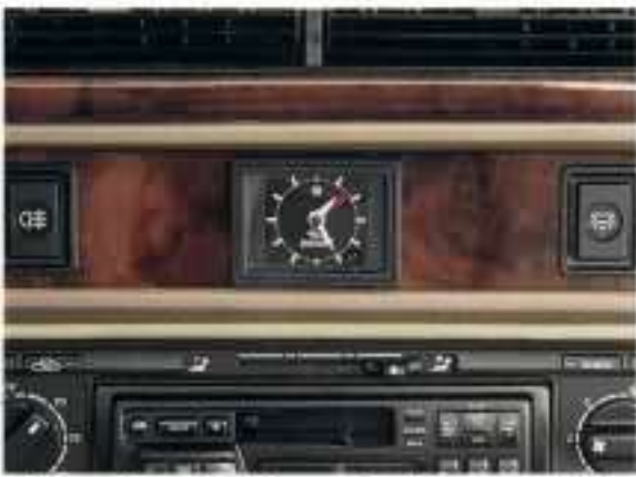
An analog clock is provided in place of the trip computer on the 4.0L XJS.