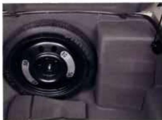
The space saver tire is now mounted on a steel wheel. (Shown with cover removed.)

Optional Equipment: Five-spoke wheels in chrome finish DI will become available after initial product launch.