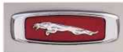
The 4.0L fender badge is highlighted by a silver leaper on a red background.